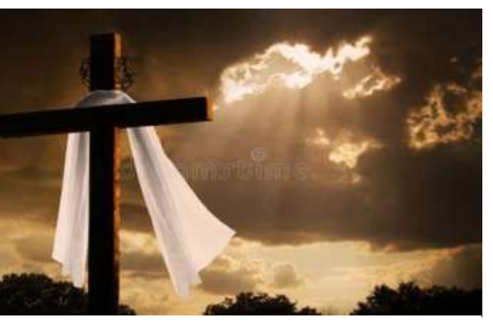
He Is Risen!

, however, got up and ran to the tomb. Bending over, the strips of linen lying by themselves, and he went ondering to himself what had happened.