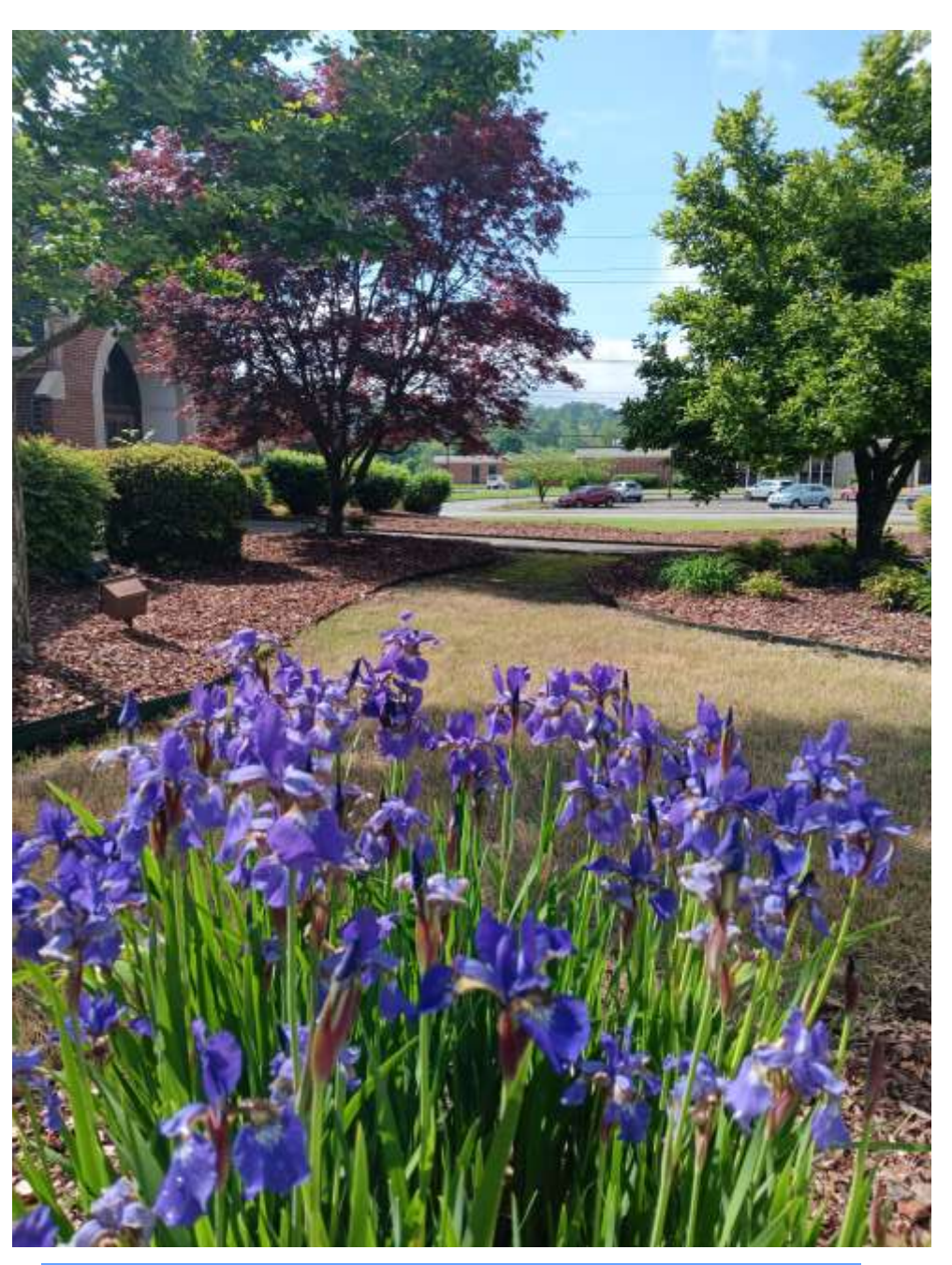
Sunday, May 4, 2025

75 McCutchen Street PO Box 472 Ellijay, GA 30540 706-635-2555