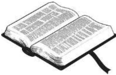
The word of God for the people of God. Thanks be to God!

Saul said to David, “Go, and the LORD be with you.”