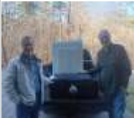
Mt. Top Boys Home

There will be a planning meeting after church today for the Administrative Council members and anyone ho wishes to join in planning for the new church year. We are excited to look forward at the new year and the exciting things that are and will be happening in 2026 at Ellijay First United Methodist Church. The meeting will take place at 11:30 following the Worship Service. If you are on the 2026 Administrative Council, please make every effort to attend and participate. Let’s make 2026 the BEST year yet in the history of our church.